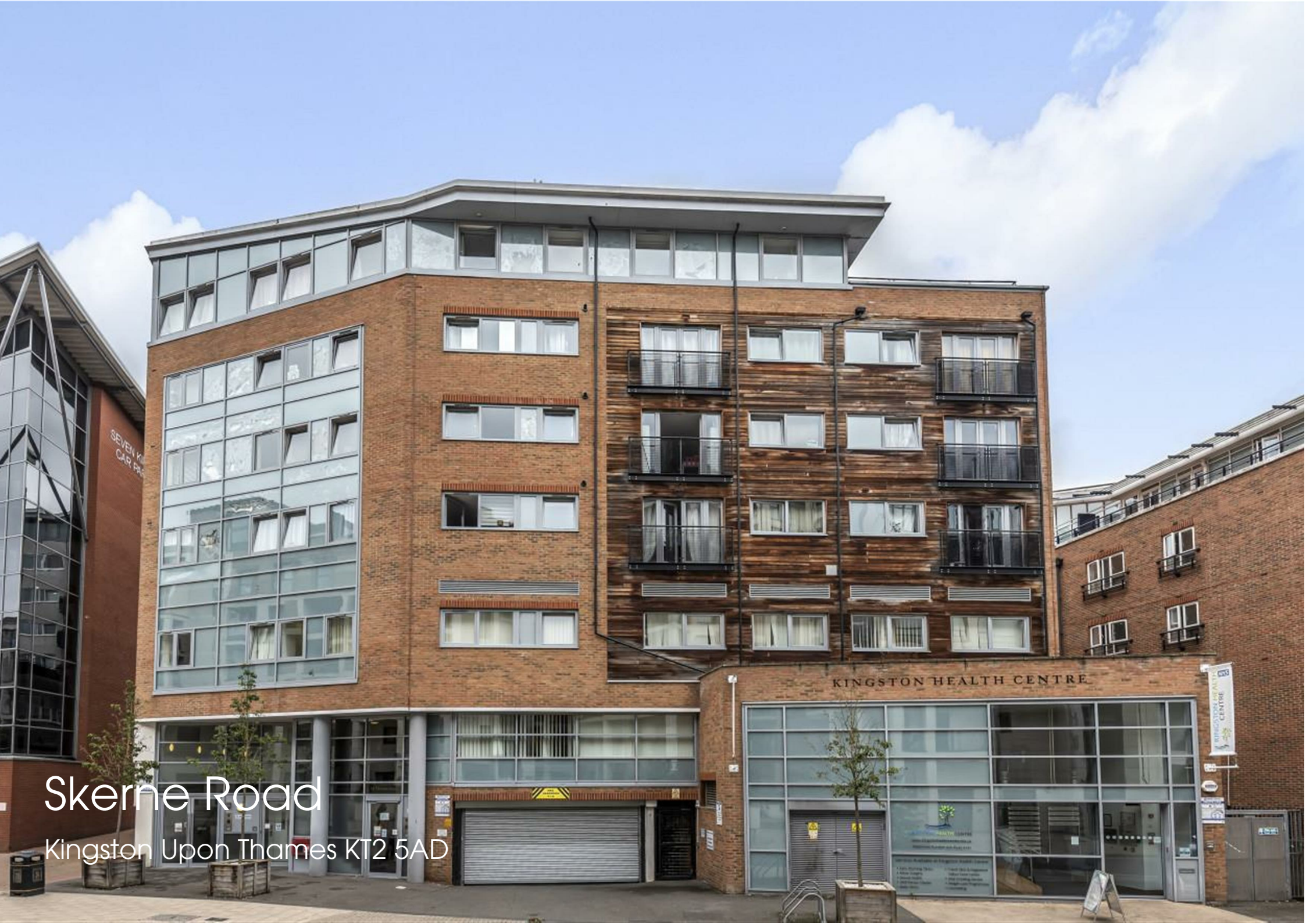
Skerne Road Kingston upon Thames KT2 5AD